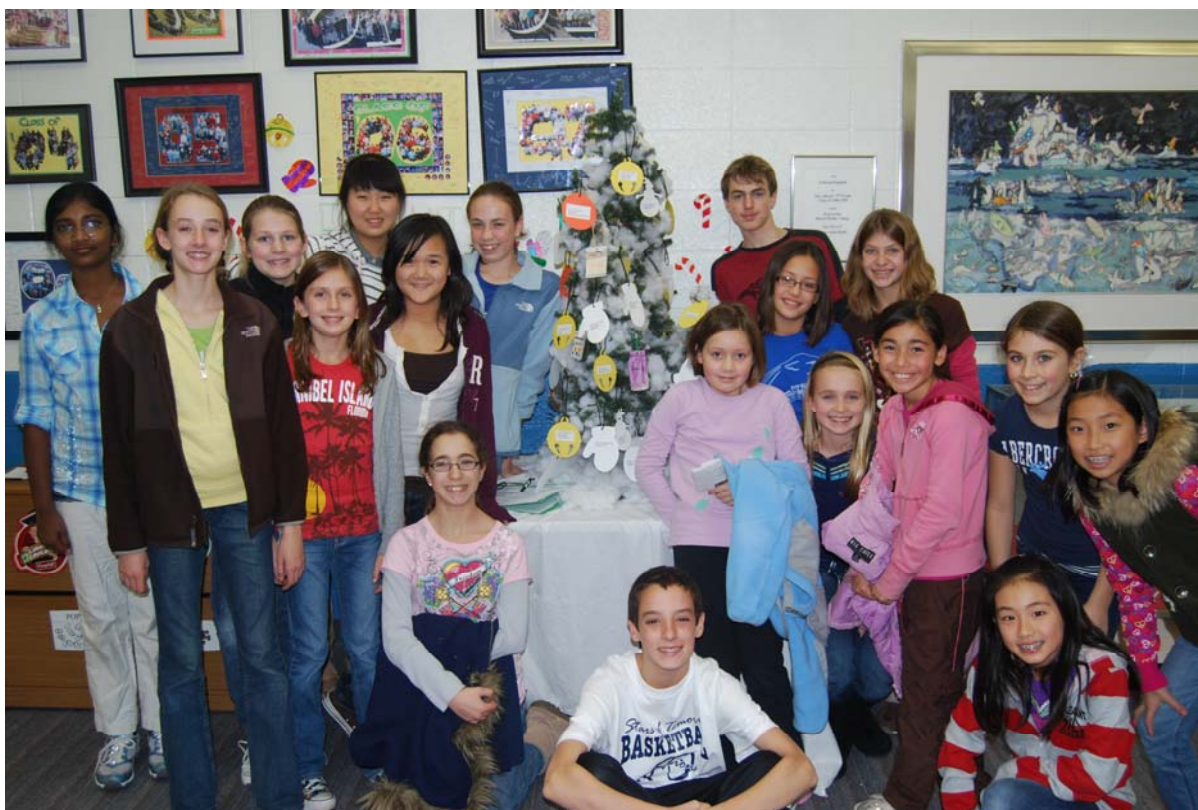
Fifth and Sixth Graders "Make a Difference" with the Holiday Giving Tree