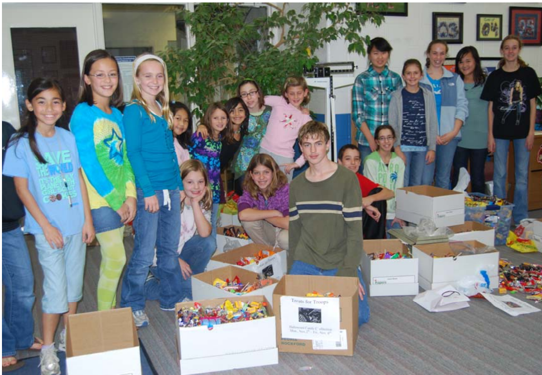
Make a Difference Club members sort through "Treats for Troops"

Make a Difference Club 6th grade Volunteer